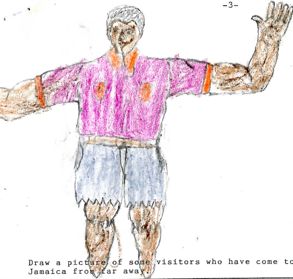
Draw a picture of some visitors who have come to Jamaica from far away.

If you would like to explain your drawing, use this space.